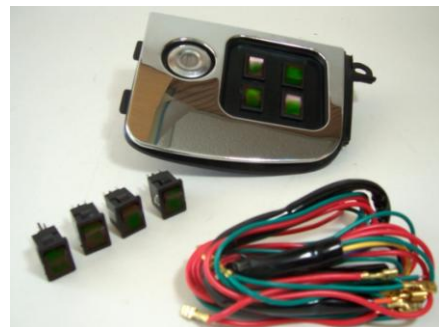
Shown lighted switches installed