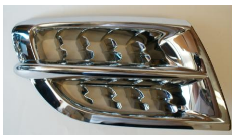
45-1629NUA Left Side