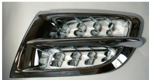
45-1629NUA Right Side

4A. On Add On part 45-1629NUB, Chrome Side fairing Accents with Mesh Inserts, the Predator Grills©'s tab will guide the positioning of the grill in the openings of the chrome mesh insert.